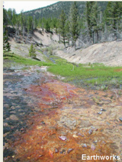
Photo: Polluted water seeping from Montana's Mike Horse Mine Impoundment into a tributary of the Blackfoot River.

Urge your rep to vote for mining reform Wednesday!