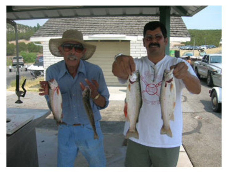
Anglers with rainbows caught at Rockport this past week.

ROCKPORT: Joseph Donnel, Park and Waterway Supervisor for Rockport State Park reports that fishing continues to be red hot for nice 12- to 14-inch rainbows using various techniques. "One group of fisherman used pop-gear and worm for three hours without a bite but then anchored up in 35 feet of water and caught fish non-stop using worms about 28 feet down. Another group trolling with leaded line, four colors out, using needlefish caught fish non-stop. Reports from bank fisherman were spotty but some were having great success. The key is to move around a lot and use different techniques. If something is not working, keep changing lures, depths, and techniques until you find something that